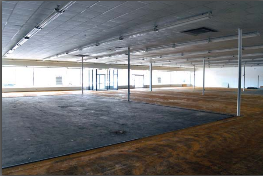
interior- vacant space